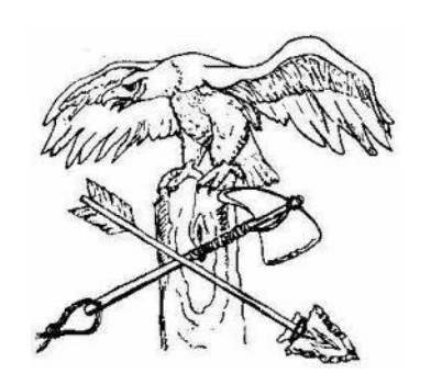
TITLE 8 BUILDING

8.1.010 ADOPTION OF CODE. The 2018 Edition of the International Residential Code (IRC) for One and Two Family Dwellings and the International Building Code (IBC) for Commercial Buildings as prepared by the International Code Council (ICC), (a copy of the of the IRC and IBC are on file with the Shoalwater Bay Tribal Court, the Building Inspector's office, the Housing Department, and Maintenance Department) is hereby adopted by reference as the Official Building Code of the Shoalwater Bay Tribe, automatically updates building code when the ICC updates code, approximately every three years.